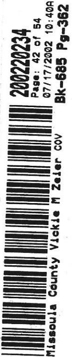
Exhibit D: Bylaws of Hellgate Meadows Residential Neighborhood Association, Inc.

Exhibit C: Articles of Incorporation of Hellgate Meadows Residential Neighborhood Association, Inc.